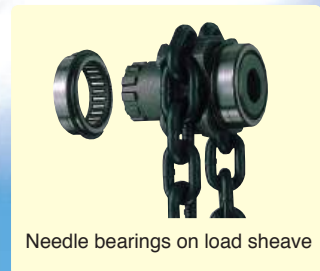
Needle bearings on load sheave